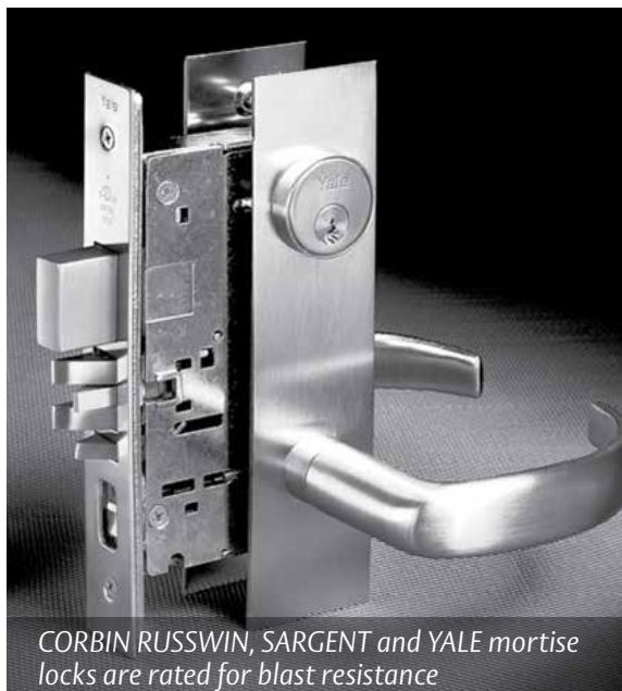
CORBIN RUSSWIN, SARGENT and YALE mortise locks are rated for blast resistance