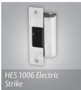
HES 1006 Electric Strike