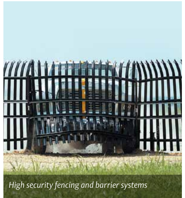
High security fencing and barrier systems

Whether your facility is a large military installation, a Veteran Affairs Medical Center, or a singular government building, ASSA ABLOY ensures every opening is properly protected. This includes perimeter gates/fencing and traditional, specialty blast, ballistic, and acoustic doorways, as well as interior cabinets and data closets. Careful consideration of each opening based on usage and risk allows for the proper selection of access control, enhancing the security of your facility while keeping costs in line.