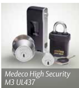
Medeco High Security M3 UL437