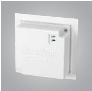
Low-Power Power Supply SECURITRON EcoPower™