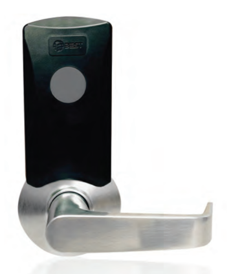
BEST SHELTERTM is a wireless responsive lockdown solution that can be configured to adapt to your building and security protocol. BEST offers a full suite of lockdown products for the commercial environment, ensuring all points of egress are protected

SHELTER—a unique combination of code-compliant mechanical hardware and proven technologies—is a responsive lockdown solution specifically designed for K-12 environments and their limited budgets. Even more, SHELTER was developed with input from those who have experienced live lockdown situations. This distinctive perspective lead to an innovative set of features and functionality that allows schools to custom tailor SHELTER so it immediately responds the way you need in a lockdown situation.